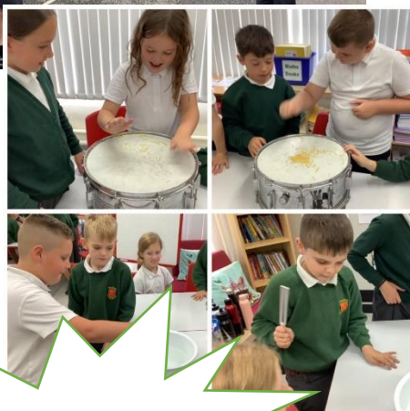
Year 4 are Super Scientists!