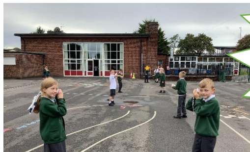
Year 3 – Attendance Winners!