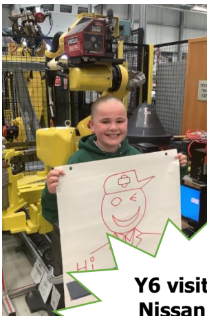
Y6 visit Nissan