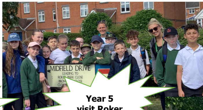
Year 5 visit Roker