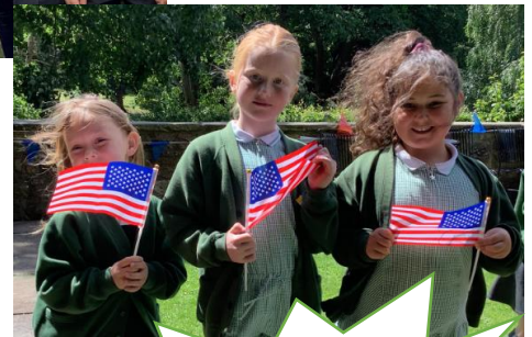
Washington Old Hall