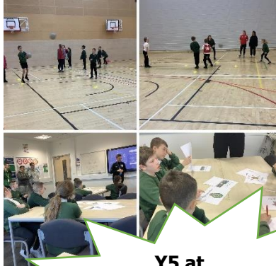
Y5 at Sunderland College