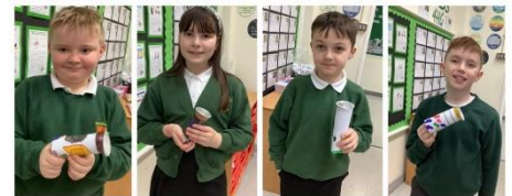
Year 4 DT - Torches