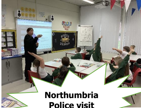
Northumbria Police visit Year 5