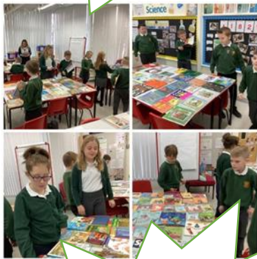
Book Banter and Book Blankets...