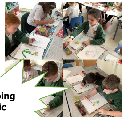
Developing Artistic Skill