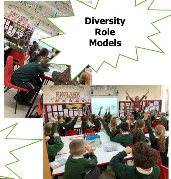
Diversity Role Models