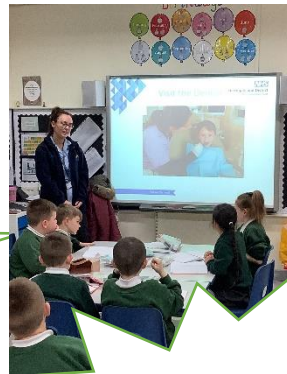
The School Nurse visits Year 3