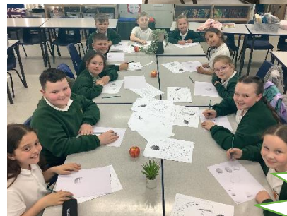
Art Club is underway...