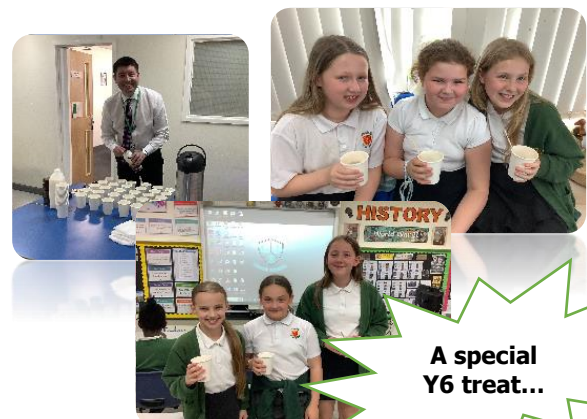
A special Y6 treat...