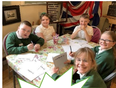
The Donnison School